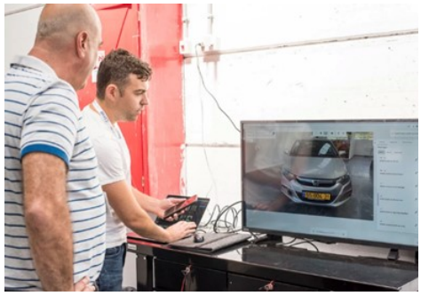
POWER proving ground specialists run tests at Drive's new development center.

The center officially opened in June for testing, technology validation and collaboration by startups and