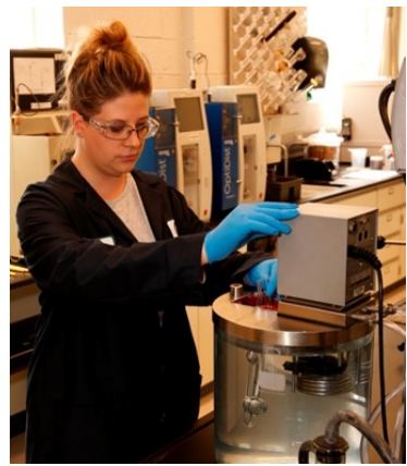
Quality control managar technician at the Gage Innovation Center

The company also recently invested $2.5 million in its Octane Testing Lab to support its production of custom fuel blends and calibration fluids for the auto industry.