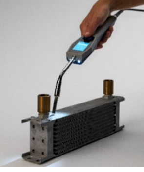
Leak testing soldered oil-cooler connections

Strix systems are faster and more accurate as well. Complex algorithms designed for Strix by INFICON development engineers in Sweden shorten measurement times, improve accuracy and speed recovery times when compared to similar handheld systems.